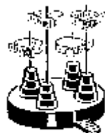
C-412 4- 1" TO 2" PIPES