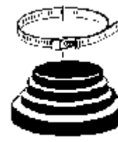
C-182 1- 8" TO 12" PIPE

Adapter Rings can modify these penetrations Snaplock Clamps . Installation Instructions . CAD Page