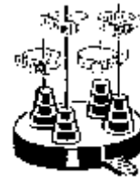
C-481 4- .375" TO 1" PIPES