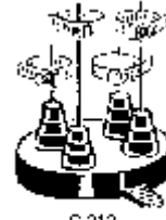
C-212 2- .375" TO 1" PIPES 2- 1" TO 2" PIPES