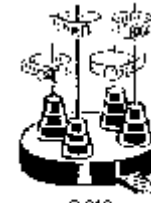
C-212 2- .375" TO 1" PIPES 2- 1" TO 2" PIPES