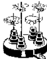
C-412 4- 1" TO 2" PIPES