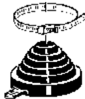
C-126 1- 2" TO 6" PIPE