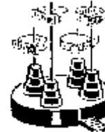
C-481 4- .375" TO 1" PIPES