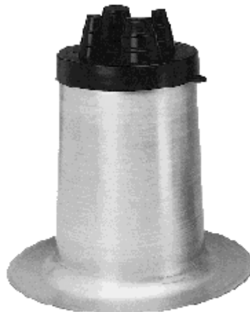
Extra Tall Alumi-Flash